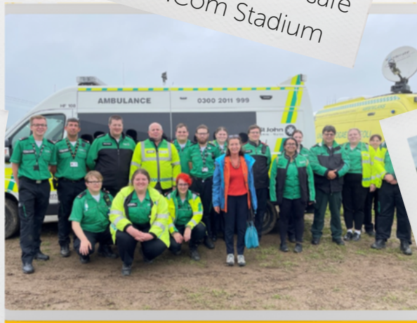
Meeting Health Minister Eluned Morgan, Minister for Health and Social Services, at the National Eisteddod