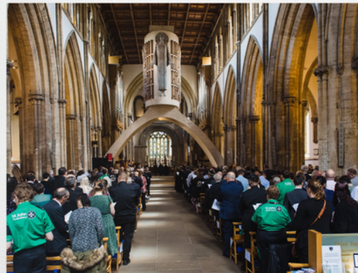
We were finally able to gather together to celebrate our investiture for the first time in two years!