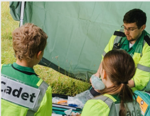
Our Wrexham Cadets attended their first ever event