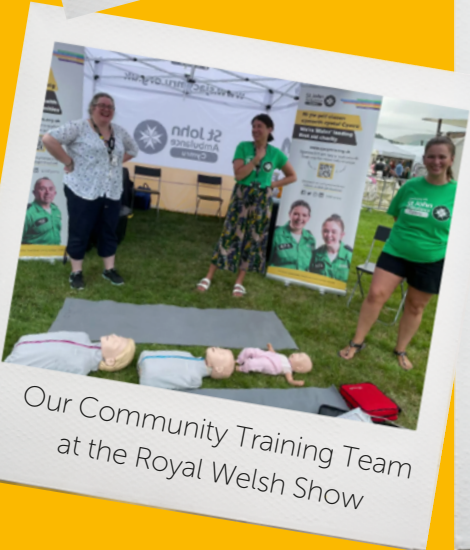
Our Community Training Team at the Royal Welsh Show