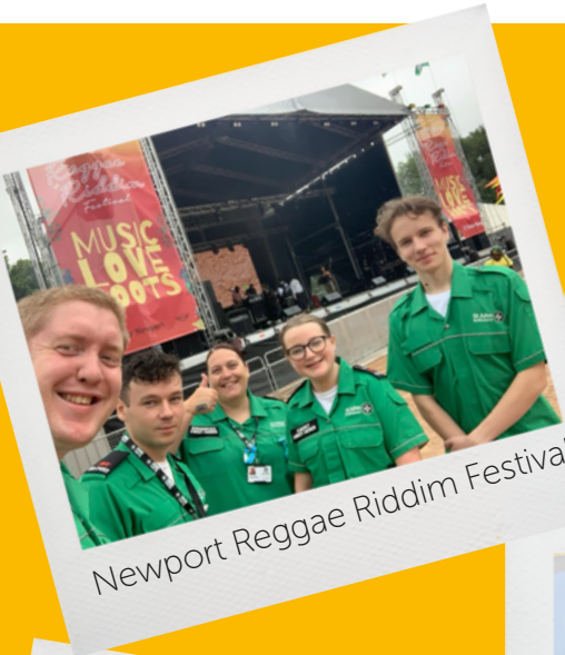
Newport Reggae Riddim Festival