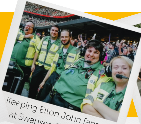
Keeping Elton John fans safe at Swansea.Com Stadium