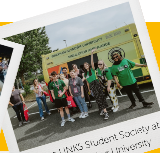
Wrexham LINKS Student Society at Wrexham Glyndwr University